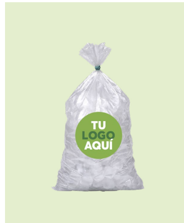
Ice Bag 5 KG (Custom-made)

Engineered from high-quality materials to ensure safe, hygienic packaging suitable for direct contact with food.