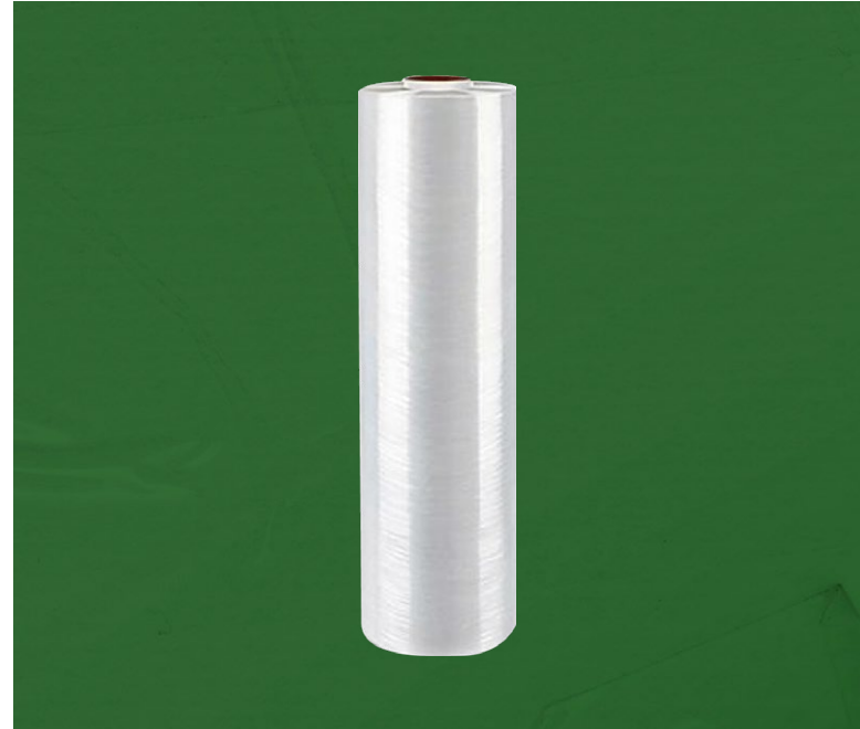
Stretch Film (Manual and Automatic)

Durable, long-lasting performance Constructed from solid, high-quality wood, ensuring strength and extended service life. Designed to be stackable and reusable, optimizing space and investment.