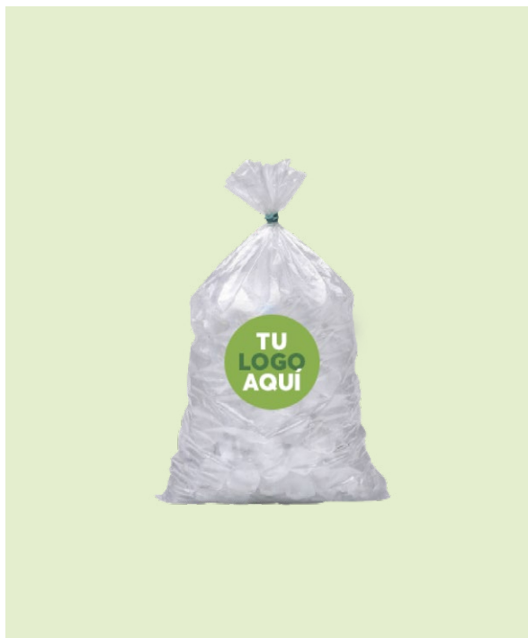
Ice Bag 3.6 KG (Custom-made)

Engineered from high-strength polyethylene, ideal for packaging, storing, and distributing ice safely and efficiently.