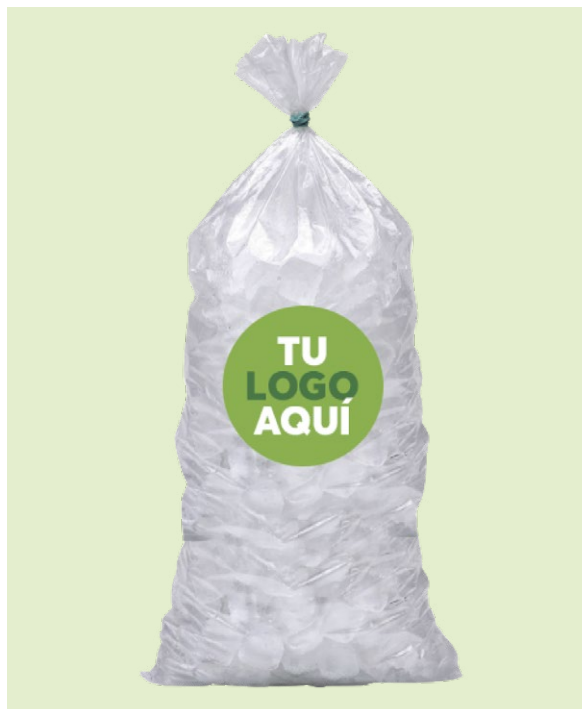
Ice Bag 10 KG (Custom-made)

Engineered from high-strength polyethylene, ideal for packaging, storing, and distributing ice safely and efficiently.